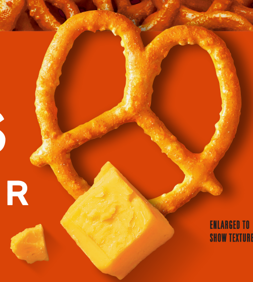
ENLARGED TO SHOW TEXTURE