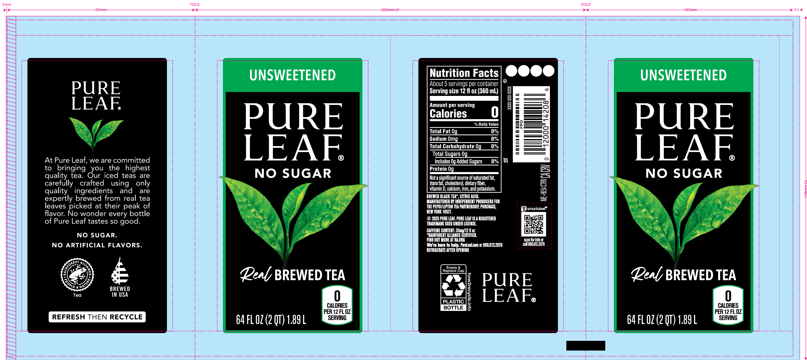
Die: 18814 Pepsico 64 oz Pure Leaf bottle